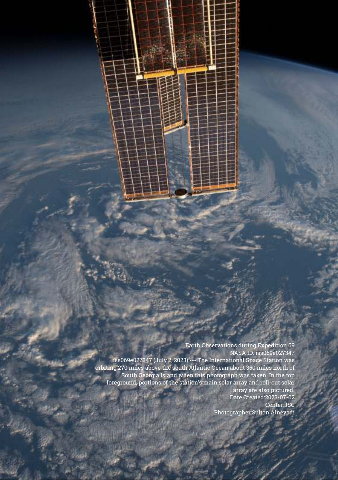
Earth Observations during Expedition 69 NASA ID: iss069e027347 iss069e027347 (July 2, 2023) --- The International Space Station was orbiting 270 miles above the south Atlantic Ocean about 350 miles north of South Georgia Island when this photograph was taken. In the top foreground, portions of the station's main solar array and roll-out solar array are also pictured. Date Created:2023-07-02 Center:JSC